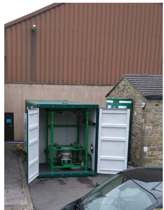
The TransPAC on site at Embsay WTW