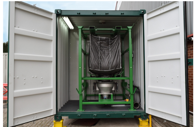
TransPAC during FAT testing at Transvac

The client was pleased with the quick turnaround from Transvac - in fact, thanks to the stock unit, the whole timescale from order placement to delivery was just one week.