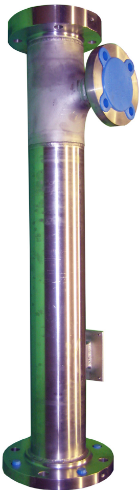
Atmospheric Air Jet Ejector in stainless steel

The inlet pressure of a Liquid Ring Pump is limited to approximately 30 mbar abs because of the vapour pressure of its seal liquid (usually water). The addition of an Atmospheric Air Jet Ejector enables the Liquid Ring Vacuum Pump to operate outside its cavitation range allowing operation down to nearly 4 mbar abs.