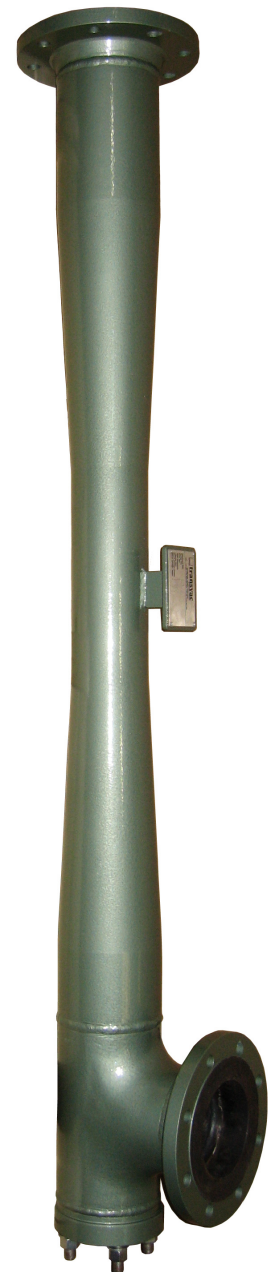
Atmospheric Air Jet Ejector in carbon steel

In operation an Atmospheric Air Jet Ejector uses the energy available from the expansion of atmospheric air to the Liquid Ring Pump inlet pressure to drive the Ejector. Atmospheric air enters the Ejector and passes through the nozzle where the pressure energy is converted into kinetic energy. On leaving the nozzle at high velocity a region of low pressure is created in the suction chamber which entrains the process fluid. The two streams then combine within the throat of the Ejector before being decelerated in the outlet cone to recover pressure to suit the Liquid Ring Pump inlet capability.