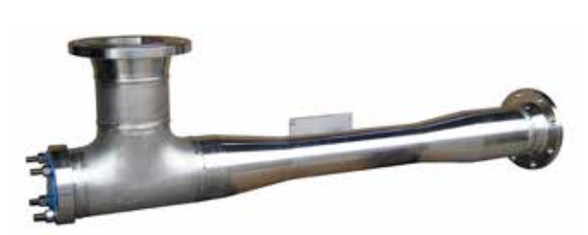
Titanium Steam Ejector for chemical Reactor