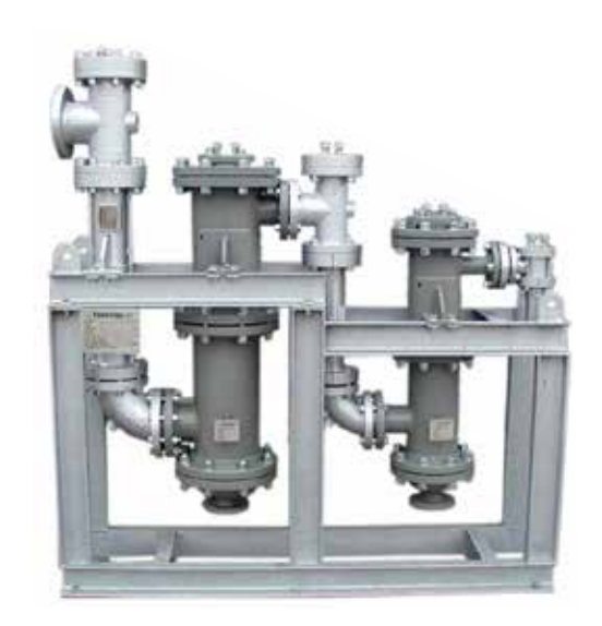
PTFE multi-stage Ejector Set for pharmaceutical plant