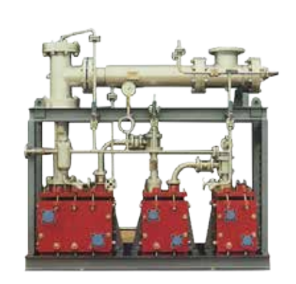
Four Stage Corrosion resistant Steam Jet Ejector System. PTFE Ejectors and Graphite Block Condensers